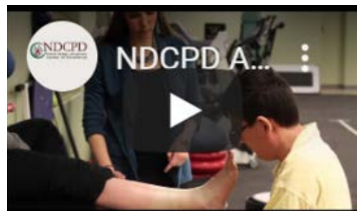
Click on the photo to open the link to the video.