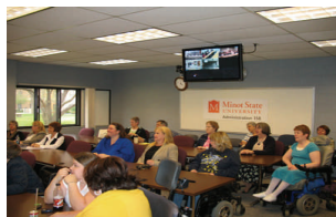
MTARS Public Forum