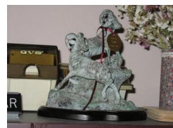
Ram Good Job Award