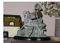
Ram Good Job Award