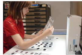
NDCPD volunteer sorting negatives.